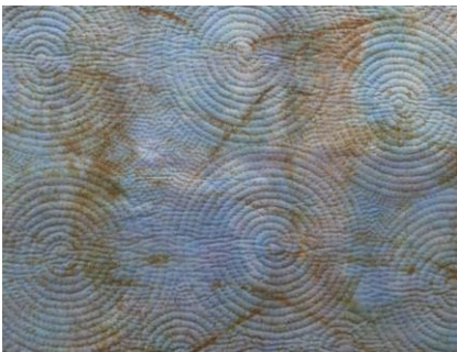
Detail image of artwork

The hand dyed fabric has had rust pigmentation applied. The piece is heavily hand stitched in a circular format like the first piece in this series. It has an irregular finish on the bottom edge. This artwork can be displayed in a vertical or horizontal orientation.