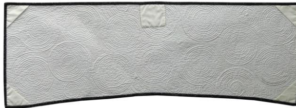
View of back of artwork